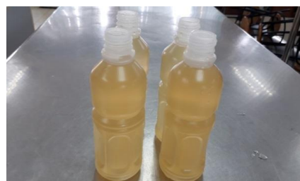
Fig. 2. Sabah Snake Grass Drink

Results show that drink sample using leaves that drying for 5 days had the highest mean score in overall acceptability (5.42) as shown in Table 2. This was expected as it was the most preferred product in color (5.12), aroma (5.00), and in taste (4.69). This indicate that the product which were most accepted by the panelist with respect to their color, aroma, and taste. However, fresh samples without drying process showed lowest score for all attributes.