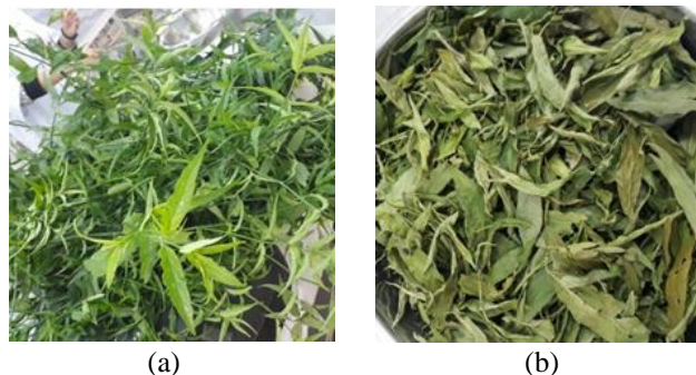
Fig. 1. Fresh Sabah Snake Grass (a) and after drying (b)

The leaves samples were labeled and subjected immediately to drying. The leaves were dried using the following methods: (1) oven drying 45°C for 2 days (2) oven drying 45°C for 5 days. Fresh sample is used as a control (C).